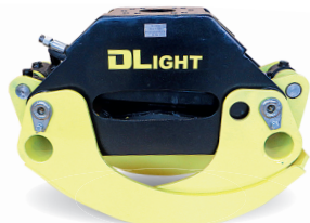
Grapple for wood DL-C4.U