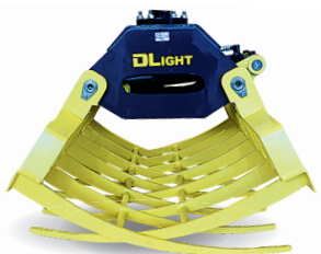
Grapple for hay DL-S14.U