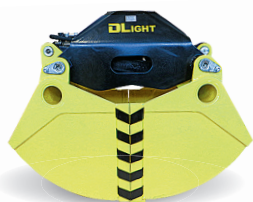
Grapple for bulk materials DL-70.44.U